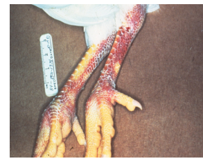
Hemorrhaging of the skin and legs is just one of the signs birds might exhibit when infected with the HPAI virus.