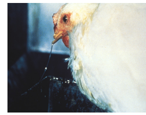
Nasal discharge (a runny nose) can be a sign of HPAI.

Biosecurity For Birds is an outreach and education campaign to raise awareness among backyard poultry owners about the steps they can take to prevent AI and other infectious poultry diseases and what to do if they suspect a disease outbreak.