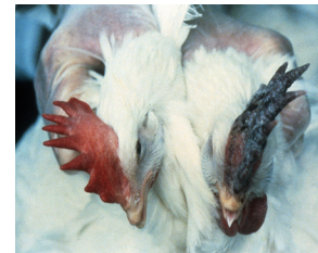
Purple discoloration of the comb could indicate HPAI.